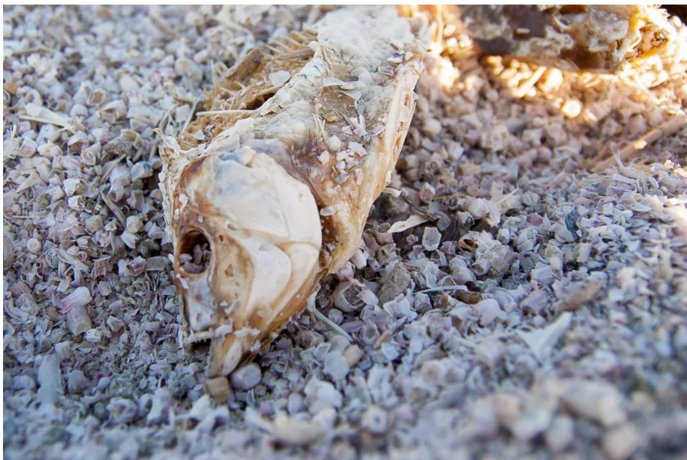
Dead Fish line the shore of the Salton Sea

The smell, almost too unbearable. The only sign of life are the flies buzzing around and the occasional bird that swoops down to pluck a fish from the water.