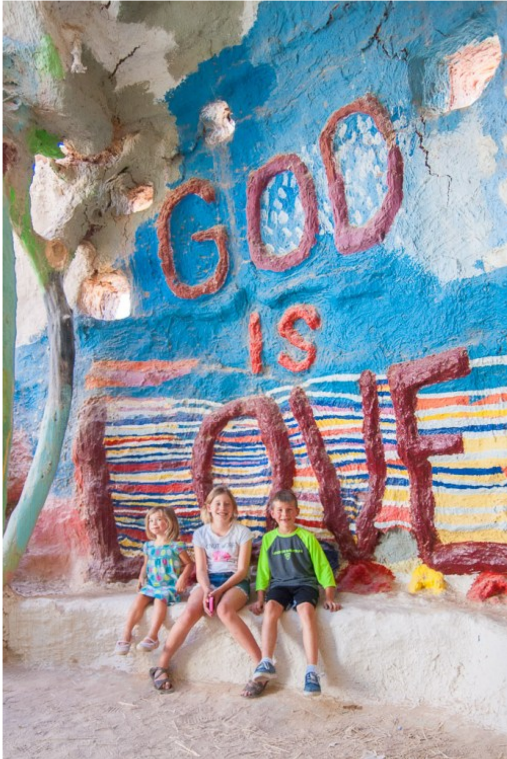
God is Love

There's no denying that Salvation Mountain definitely makes you feel happy with the vibrant