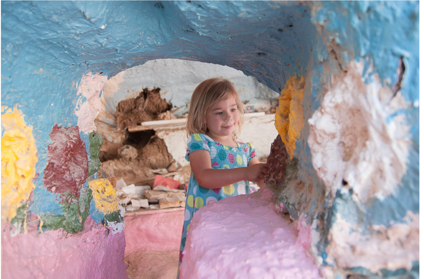
Fun inside the mountain