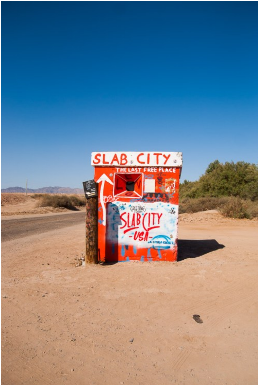
Entering Slab City

On the acres surrounding Salvation Mountain lies the “last free place in America,” known as