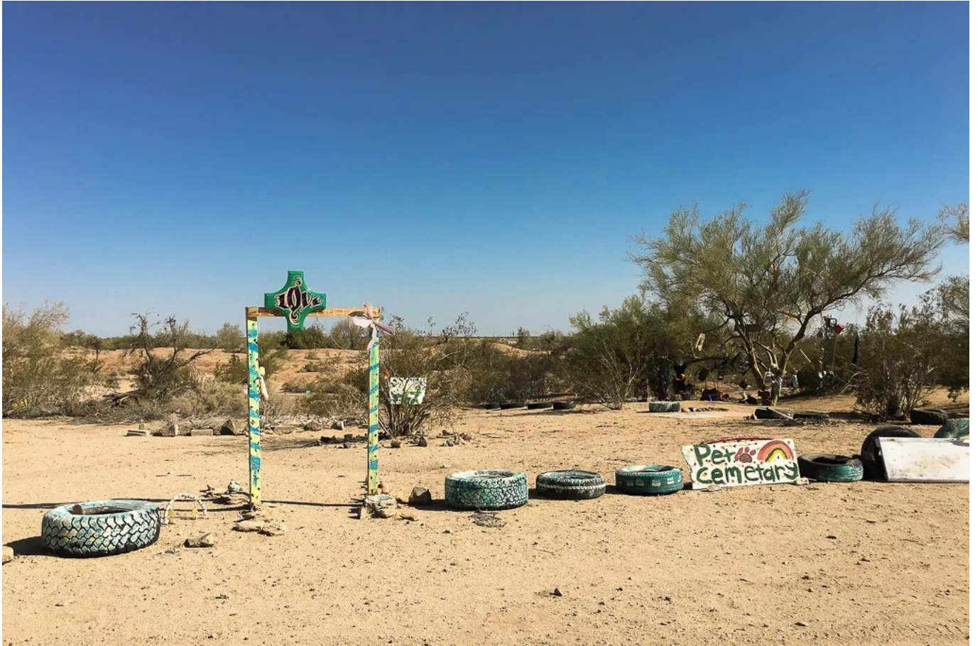
The Pet Cemetery of Slab City