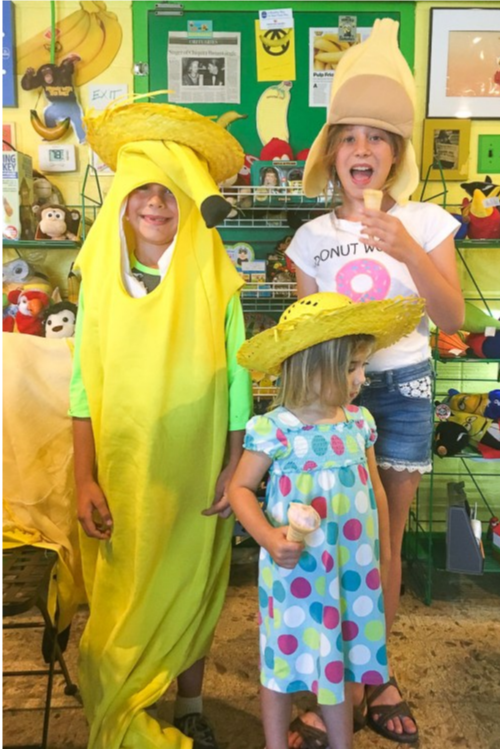
Being touristy at the International Banana Museum

Our favorite part was the homemade banana ice-cream which they churn right there in the