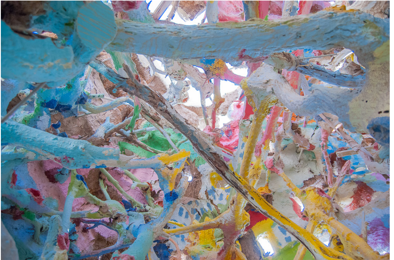
Looking up from inside