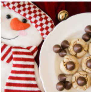
10 Days of Holiday Baking with Kids