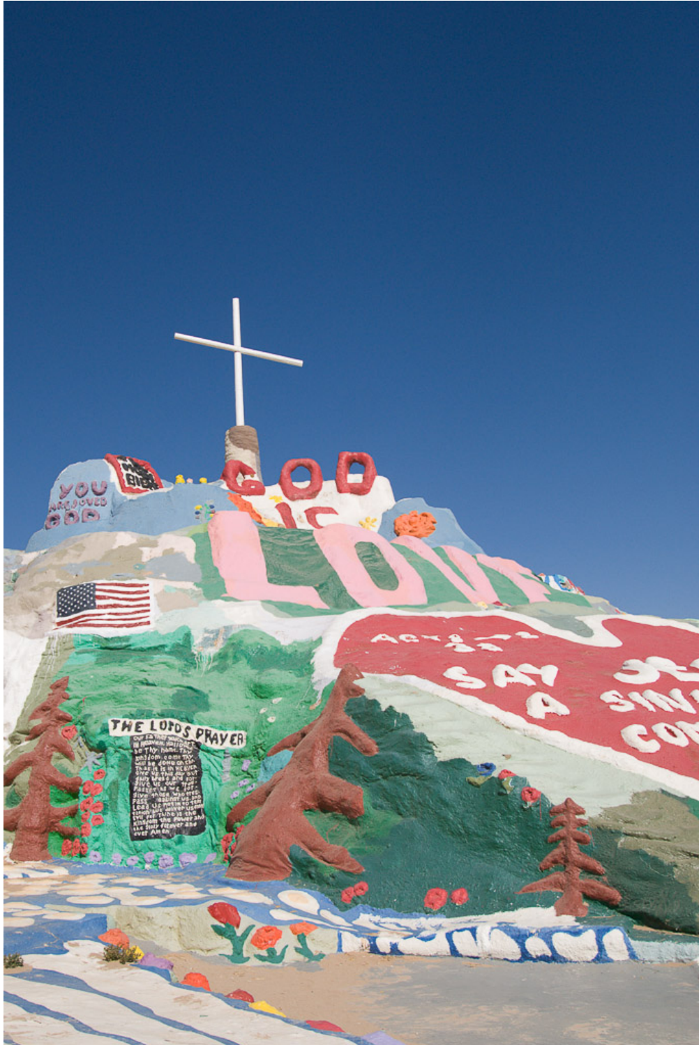
The vibrant colors stand out against the barren desert floor

Salvation Mountain is a hill in the Colorado Desert of Imperial County, California. Artist,