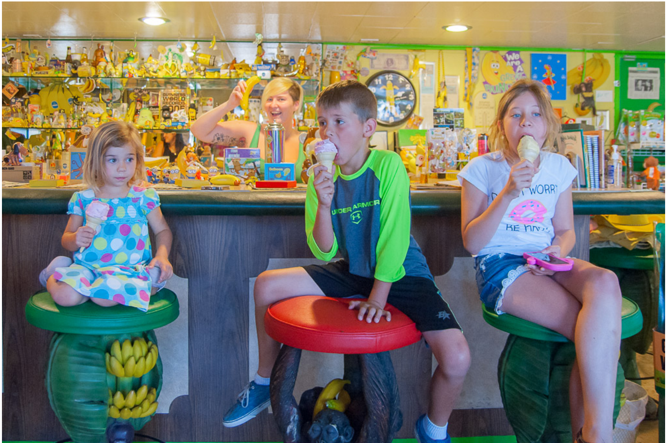
Eating ice-cream while surrounded by over 20,000 banana related items

cream. Who would have thought that a banana museum could grow so popular over such a short time. It even made it in the Guinness Book of World Records. Are you tired of the word banana yet?