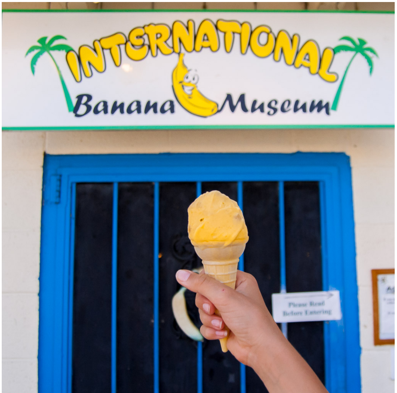
International Banana Museum

Until we noticed a little old building with a big stuffed yellow banana sitting outside. Since we desperately needed a bathroom break, we decided to stop. What we found next was pretty appealing to us. The International Banana Museum . This museum has everything banana!