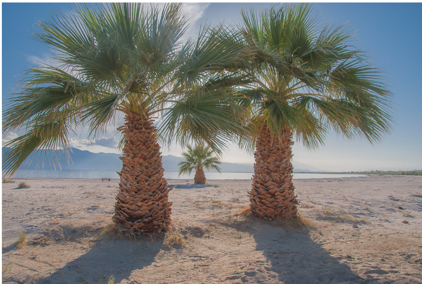
Palms of the Salton Sea

year. People come to camp, boat, birdwatch and even fish when the temperatures are mild during the spring and fall. The recently built visitor center is a beautiful addition where you can come to learn everything about this rare and interesting body of water.