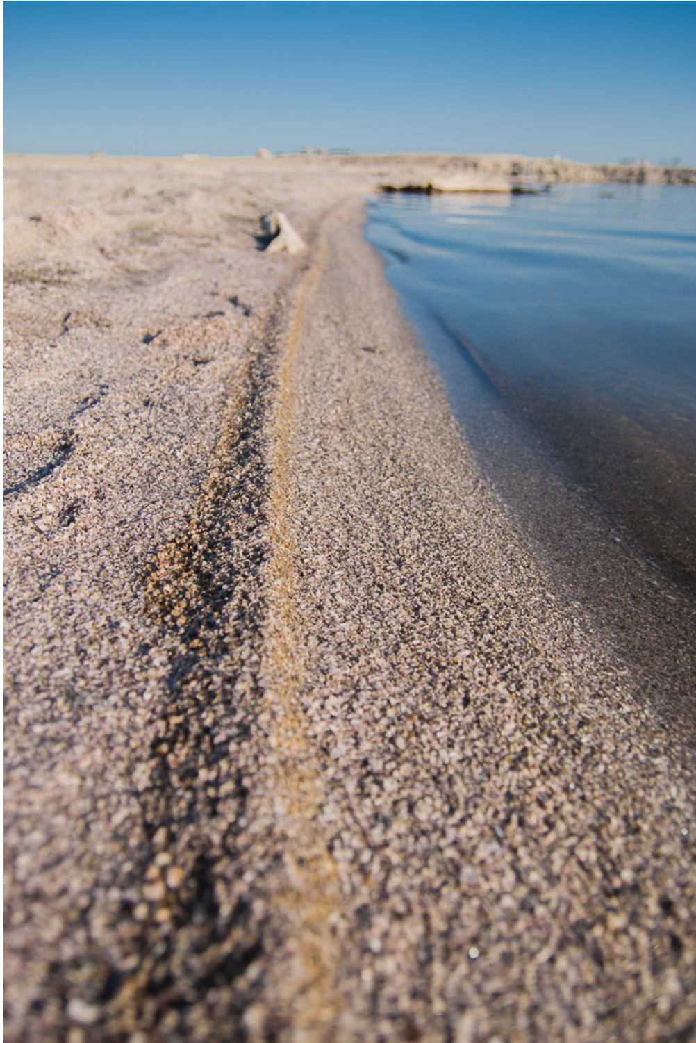
The shoreline of the Salton Sea

The Salton Sea is also a large recreational area that attracts more than 100,000 visitors each