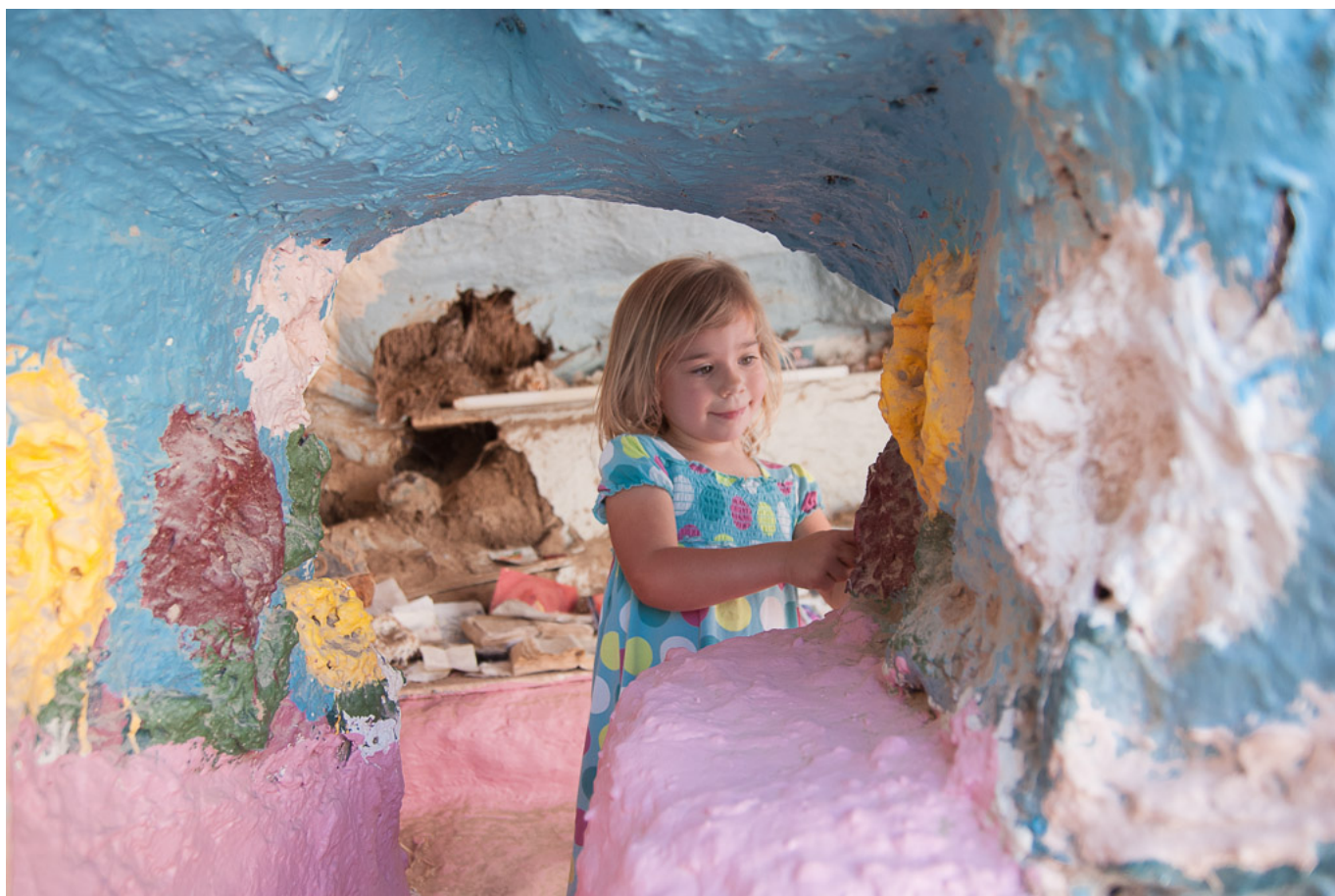
Fun inside the mountain