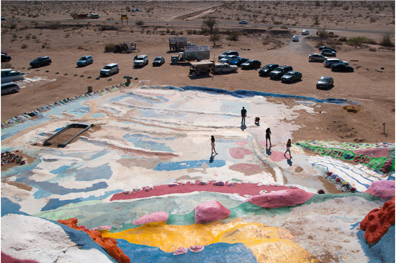
The view from the top

Not only can you climb to the top of Salvation Mountain, but you can venture through it. There are a few tunnels that weave in and out and through the back.