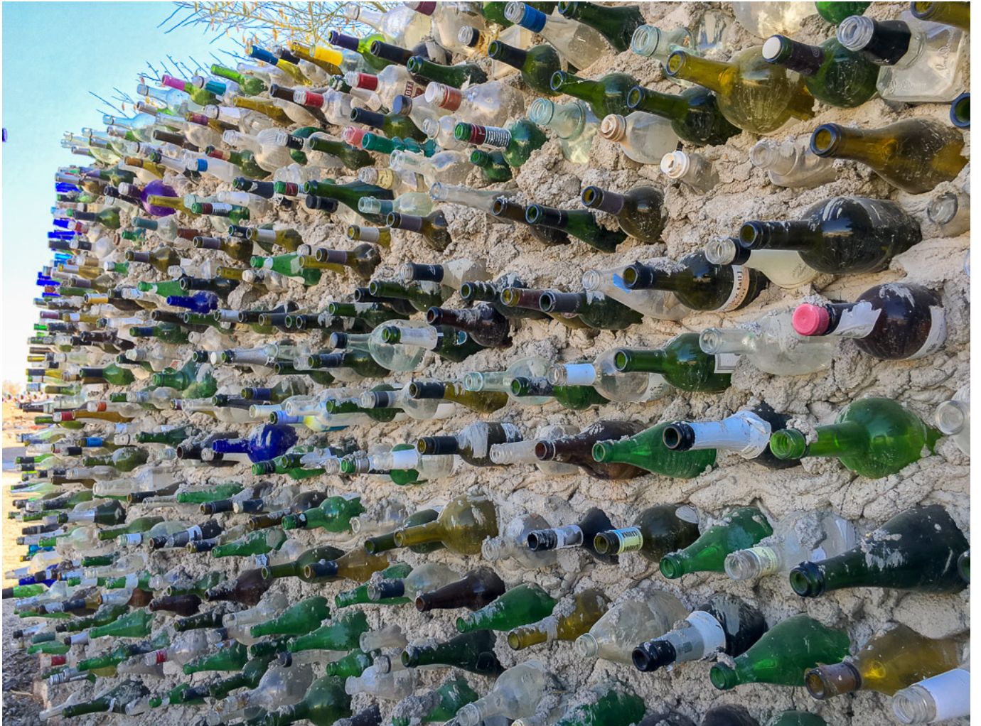
The Bottle Wall located in the Sculpture Garden