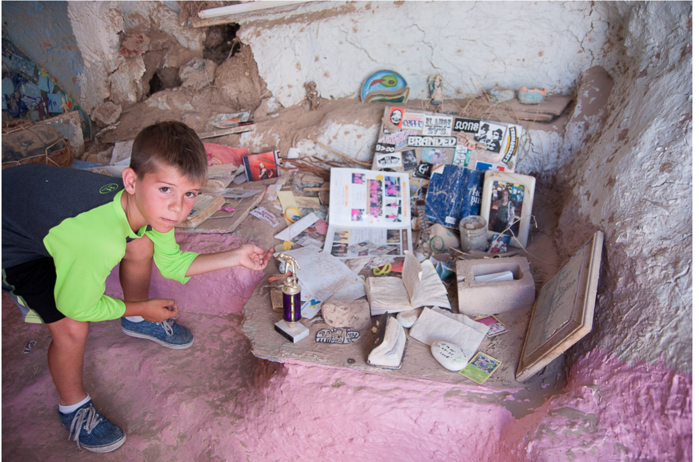
Finding treasures in the caves