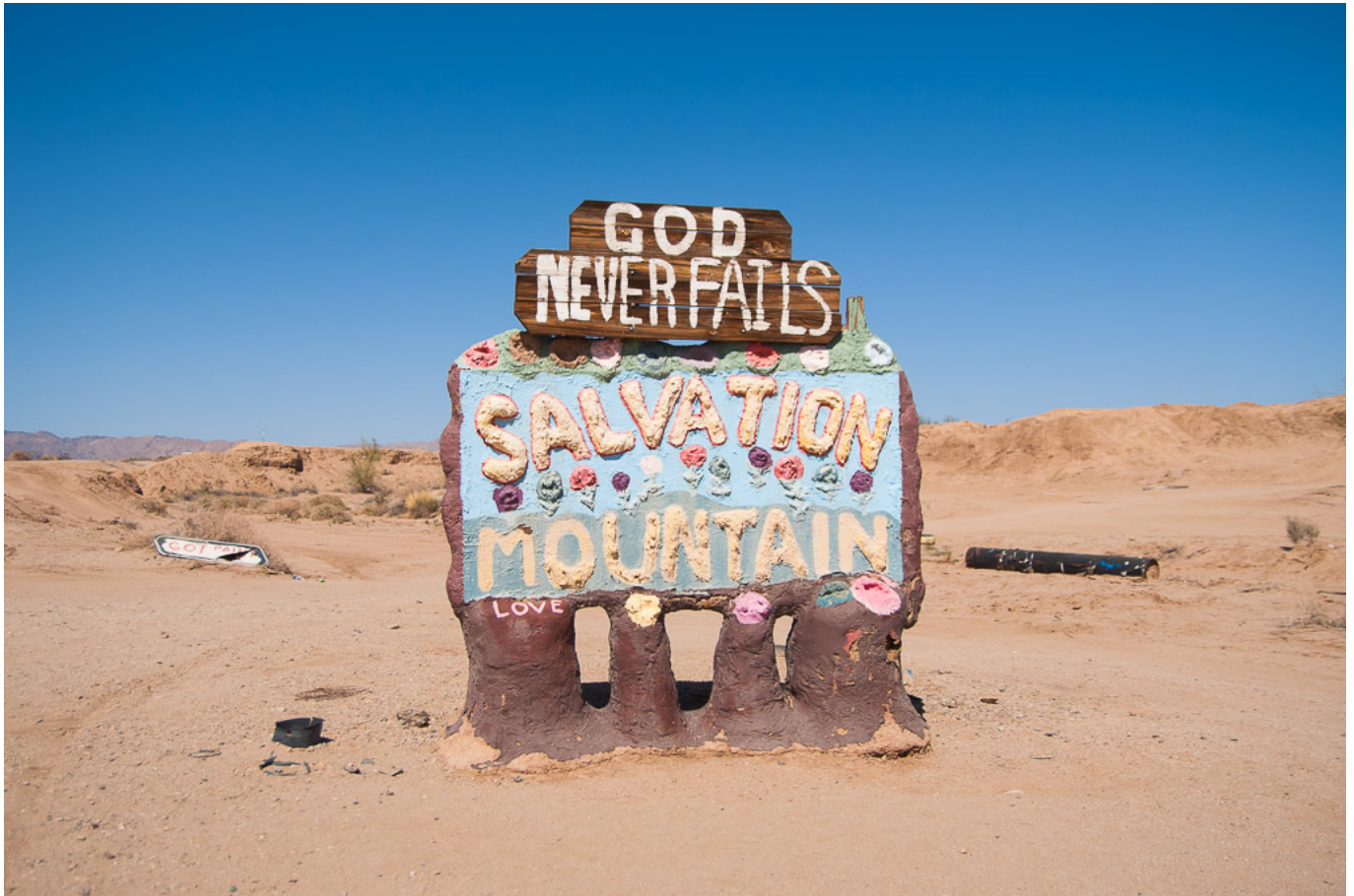
Welcome to Salvation Mountain

After setting our eyes upon more bananas than we've ever seen in our entire lives, we set off for our next destination. We continued driving southeast for an additional 40 minutes until we saw a colorful hill that stood out against the barren desert floor.