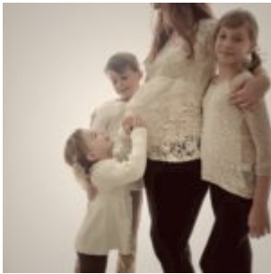
Oops We Did it Again!