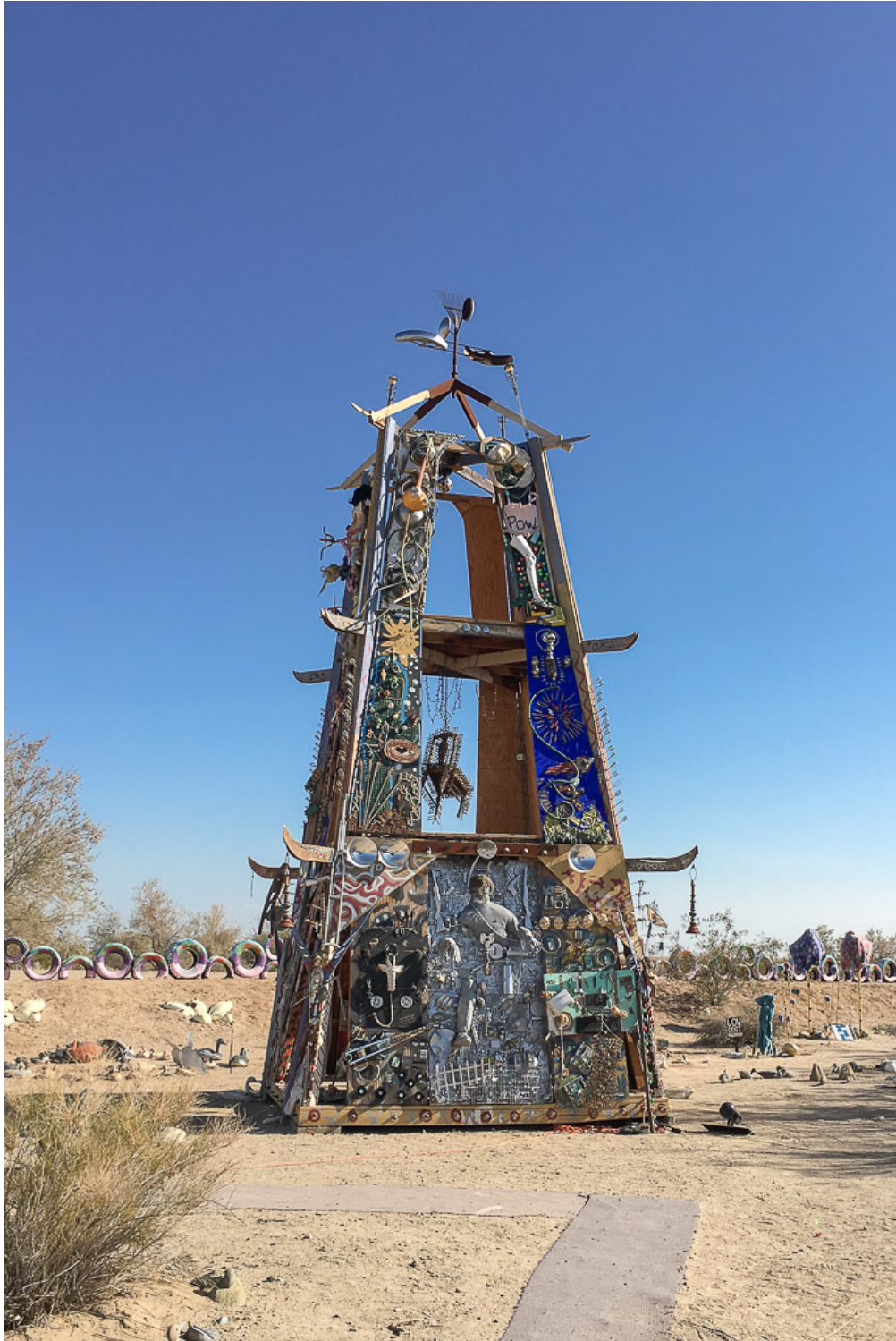
More sculptures at the Slab City Sculpture Garden