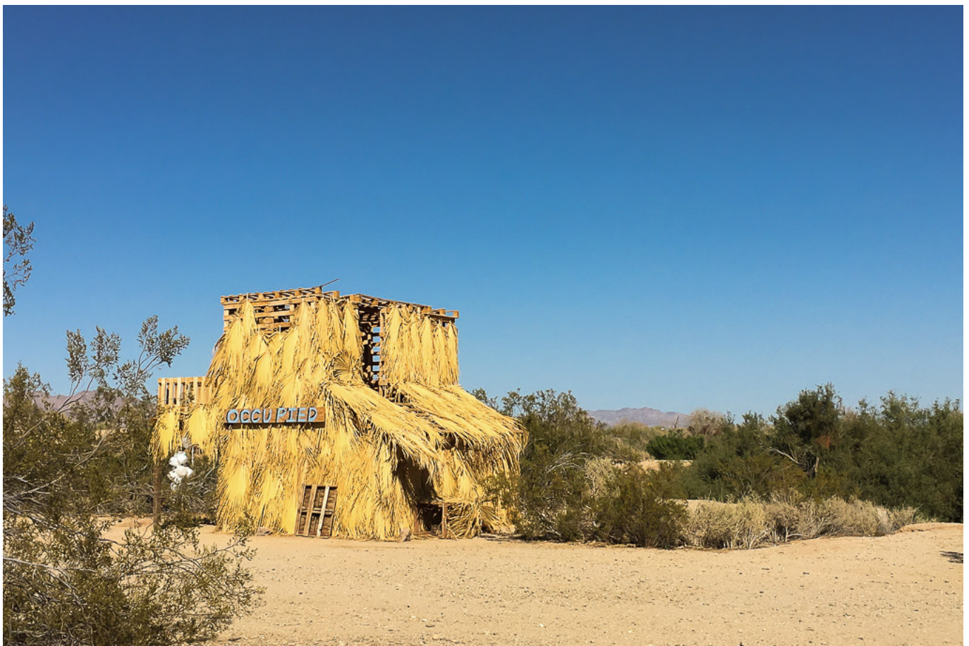
One of the many homes of Slab City

Slab City. The residents of Slab City live rent free on 640 acres of state-owned land. Those who want to escape the everyday grind of the American lifestyle come here. Slab City is completely off the grid. There is no electricity, no sewer, and no water. Homes come in all varieties including trailers, motorhomes, and tents. There are homes made of metal scraps and others made from trees and palm leaves. Some have solar panels and generators to produce electricity.