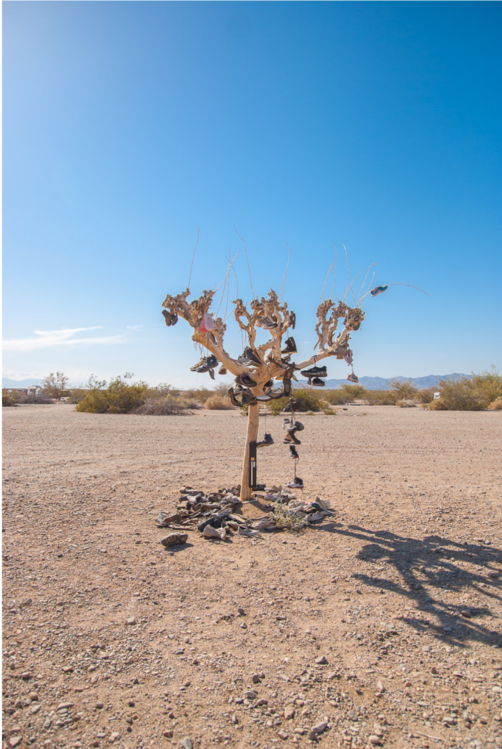
The Shoe Tree that stands near the entrance to Slab City