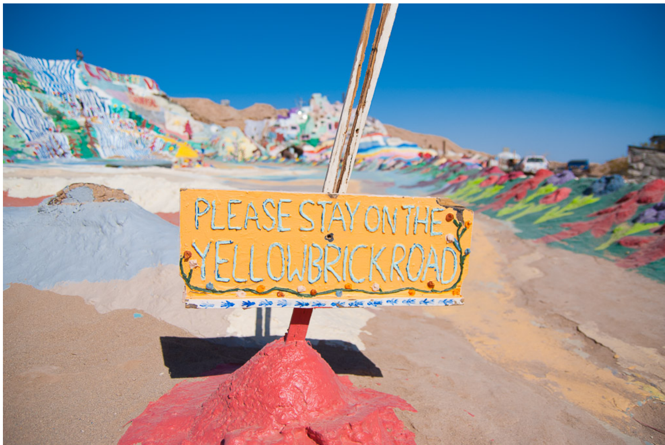
Follow the Yellow Brick Road to the top for a bird's eye view