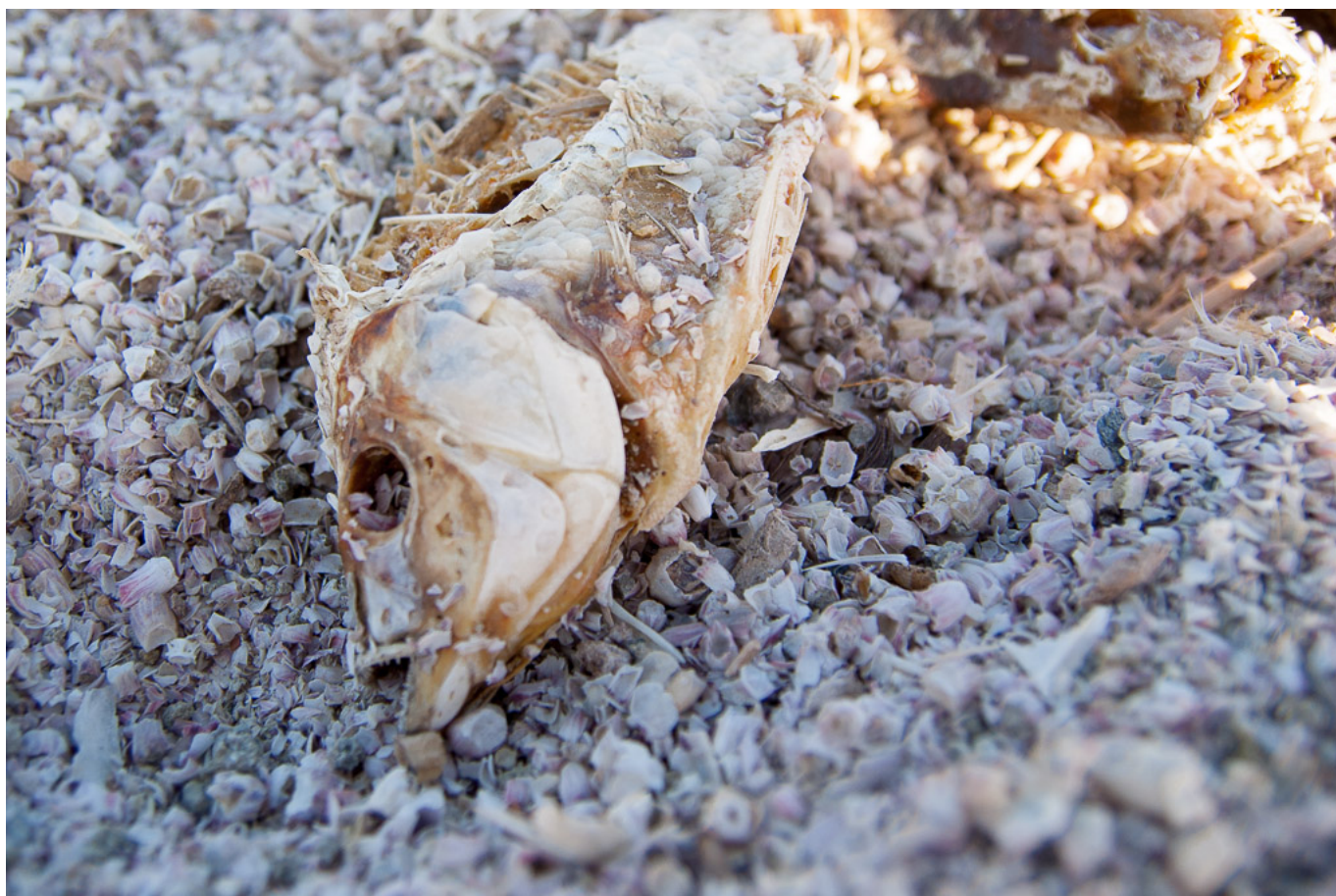
Dead Fish line the shore of the Salton Sea

The smell, almost too unbearable. The only sign of life are the flies buzzing around and the occasional bird that swoops down to pluck a fish from the water.