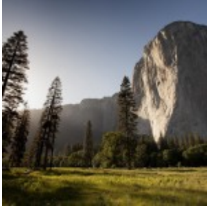
Hiking and Biking around Yosemite Valley