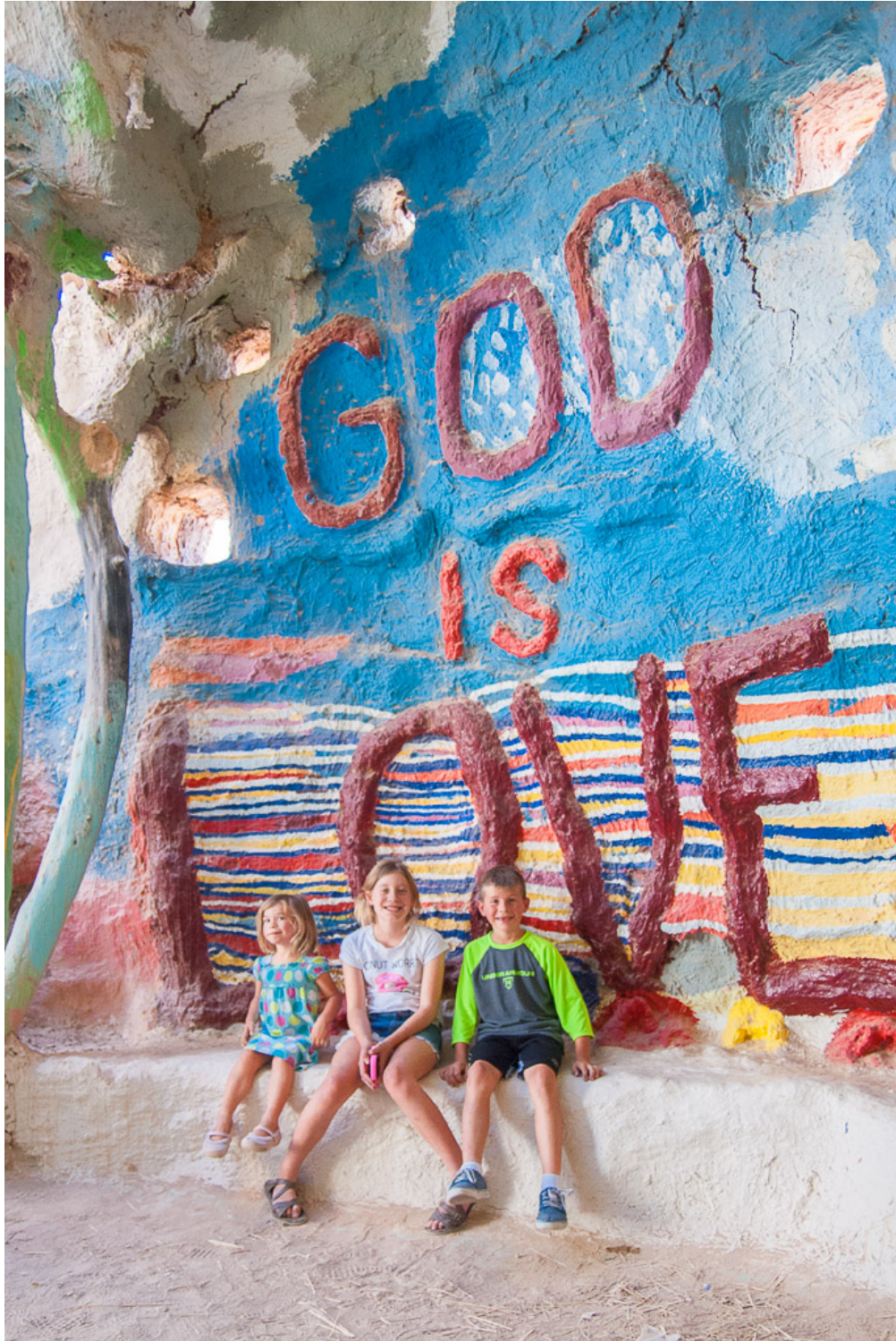
God is Love

There's no denying that Salvation Mountain definitely makes you feel happy with the vibrant