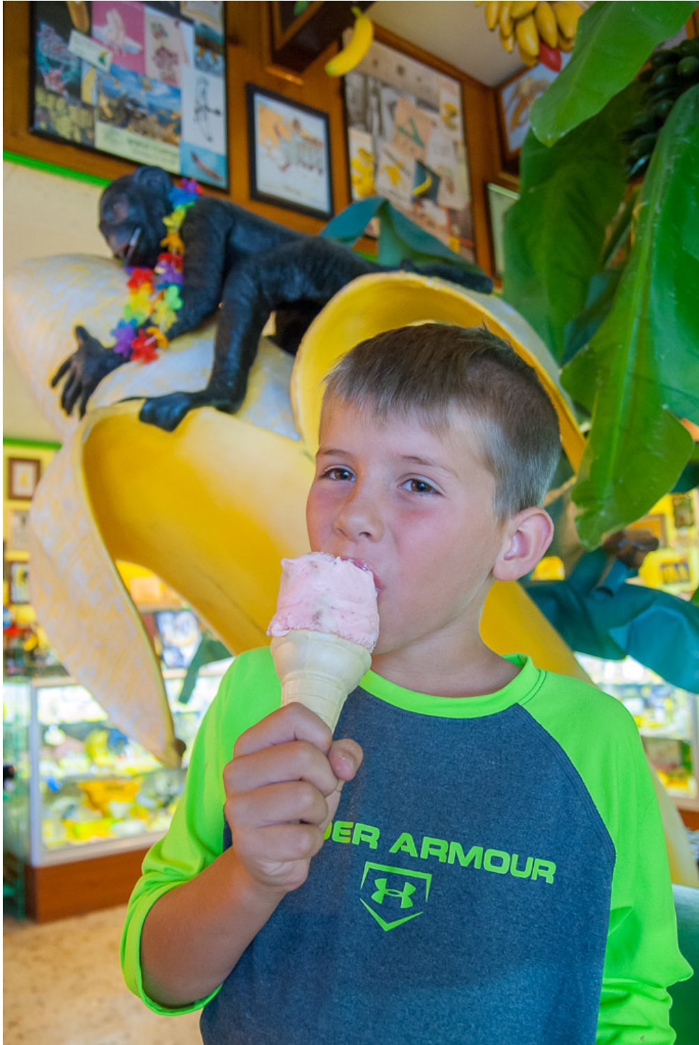
Maddox happy to have some ice-cream on such a hot day

You can avoid the $1 entrance fee by making a small purchase per person which includes ice-