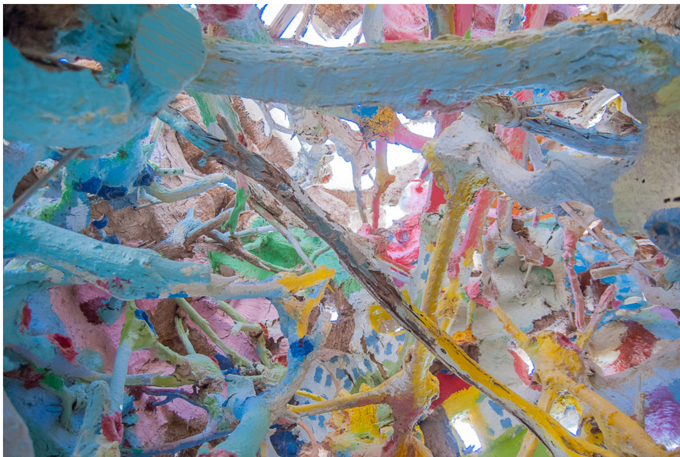
Looking up from inside