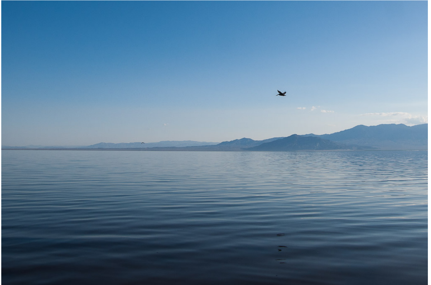
A bird flies overhead in search of dinner

The Salton Sea is one of the largest inland seas and the largest body of water in the state of California. It is 227 feet below sea level making it one of the lowest spots on earth. Because the Salton Sea is landlocked, there is no outflow of water. Agricultural fields surround the area, therefore the runoff of toxins through the years is threatening the lively hood of the Salton Sea. The salinity in the water is on the rise, and it contains more salt than the Pacific Ocean. This is a real threat to more than 400 migratory birds that depend on the Salton Sea as a food source. The Salton Sea is in dire need of help.