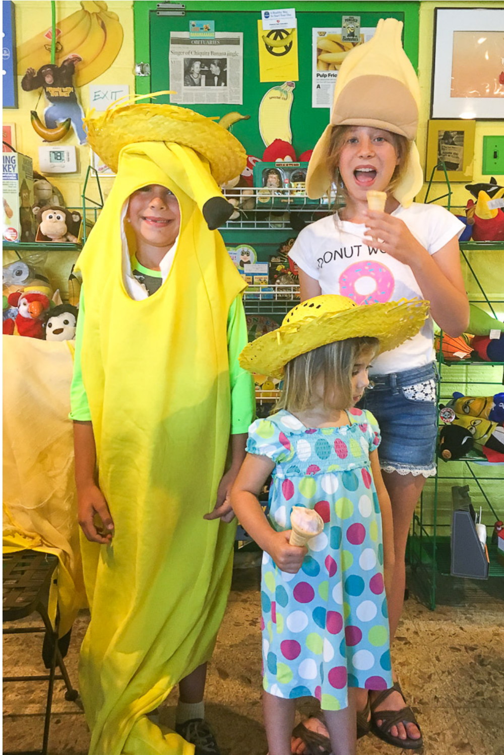
Being touristy at the International Banana Museum

Our favorite part was the homemade banana ice-cream which they churn right there in the