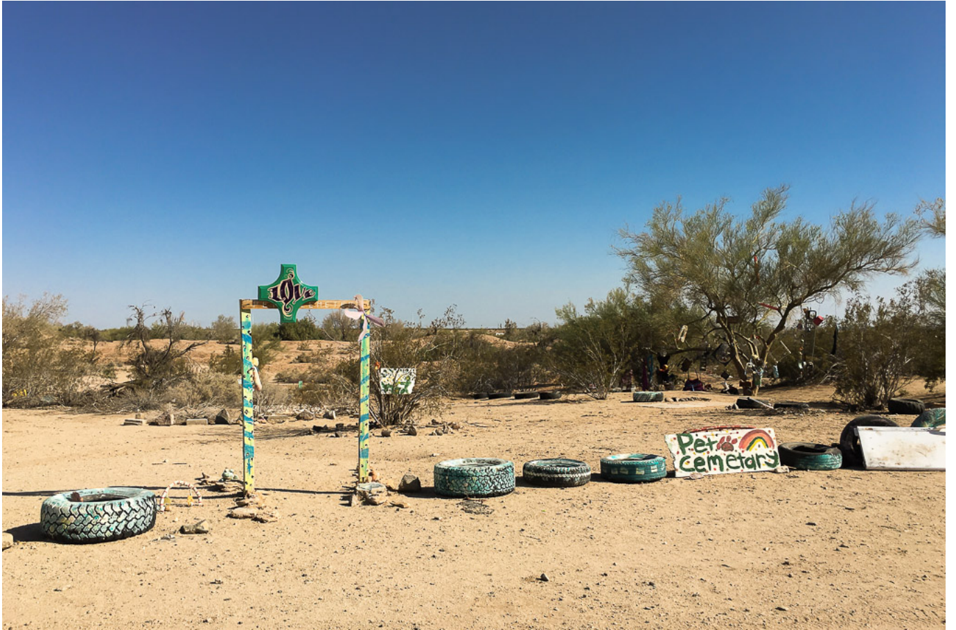
The Pet Cemetery of Slab City