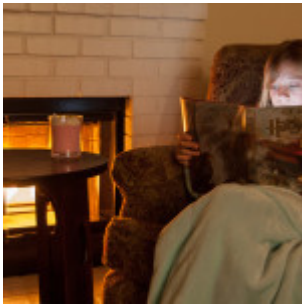
2015 Highlights and Our Final Day of Baking with Kids