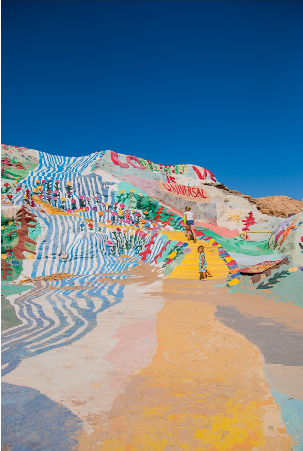
The kids following the Yellow Brick Road