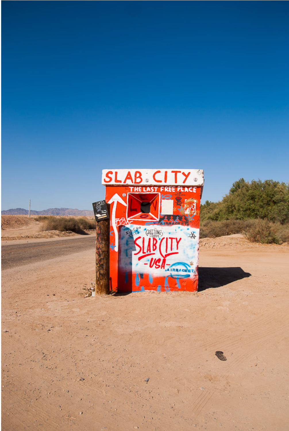
Entering Slab City

On the acres surrounding Salvation Mountain lies the “last free place in America,” known as