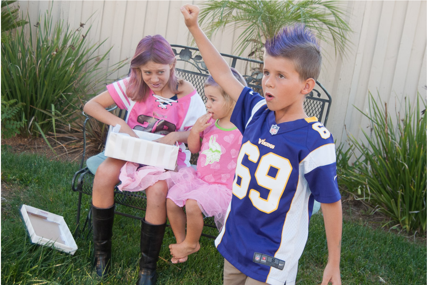
Celebrating the win!