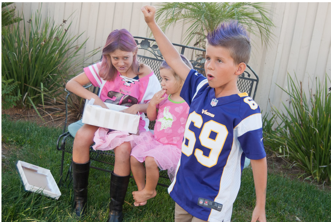
Celebrating the win!