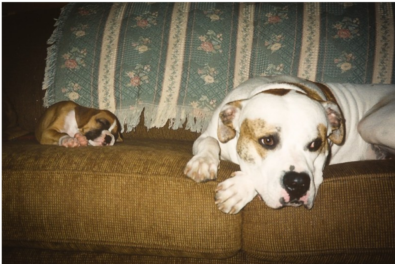
Our pups getting acquainted

In May 1999, we bought our first home in a small town just North of the cities with around 4500 people. Lindstrom, Minnesota is where we would reside for the next 15 years. Lindstrom is known as "America's Little Sweden." A beautiful small community surrounded by lakes.