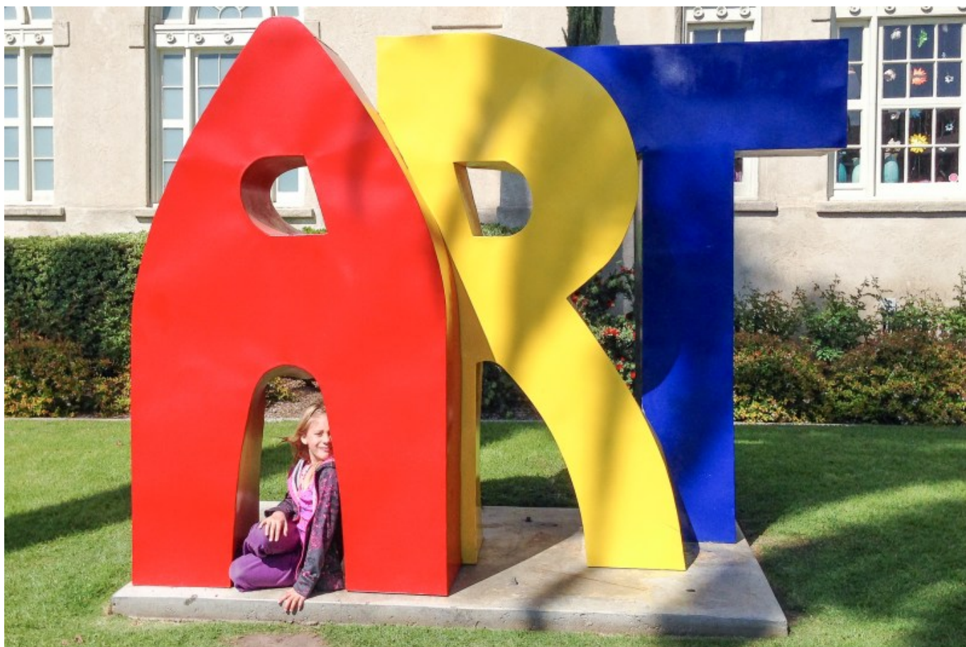
Outside the Riverside Art Museum

Her most favorite thing to do is make speed paints of puffed people on her youtube channel. Check it out by clicking on the YouTube icon at the top of the page and please subscribe if you like what you see.