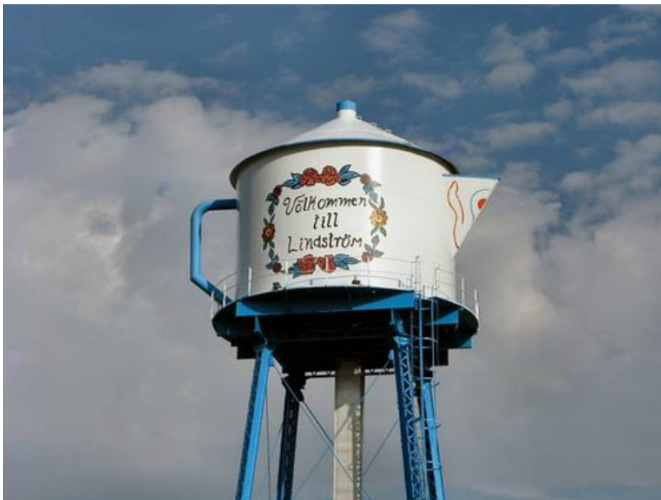
The coffee pot water tower, a Swedish landmark representing Lindström.