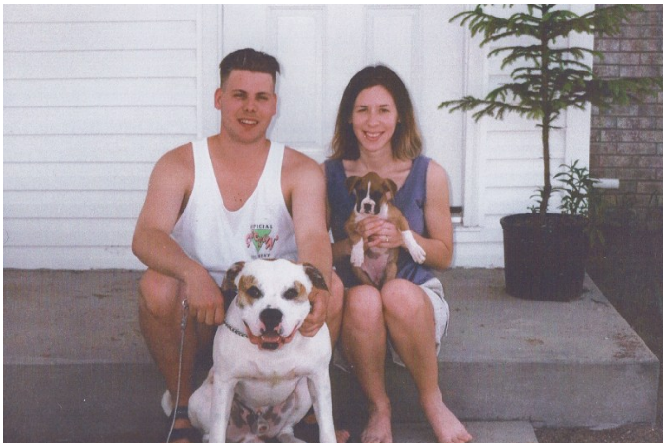
Our family back in 1999 in front of our first home in the small town of Lindstorm