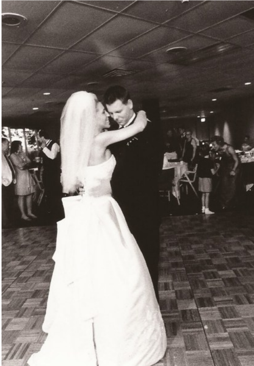
The first dance