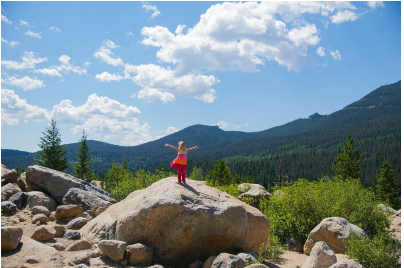
Road trip to sunny California

With 3 kiddios in tow, in August 2013, we decided to sell our little house in Lindstrom and make a 2000 mile trek to sunny California residing in the very large city of Riverside that has a population of 300,000. Yes that's right, 300,000 people in just one CA city, but we're so happy we did! California is a beautiful state and has many wonderful qualities. We've experienced many new opportunities in the past two years.