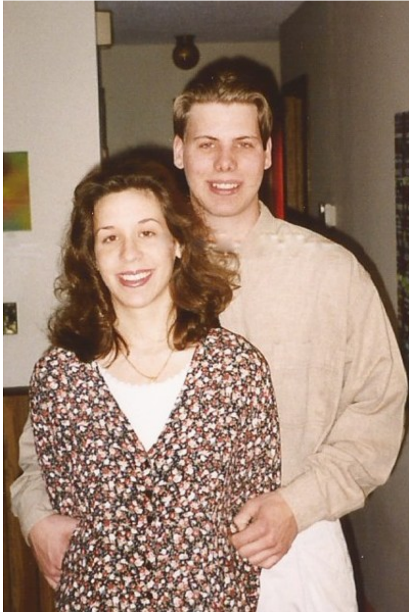
The start of the dance