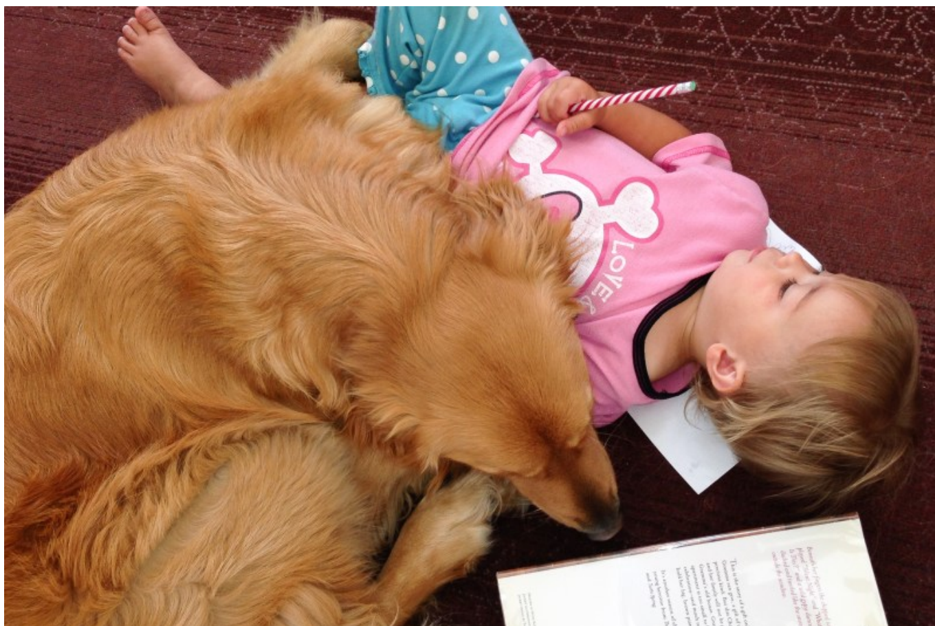
Yes, Marley would definitely be a lap dog if we let him