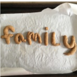
• Falling for Fall in Southern California