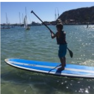
• Dana Point